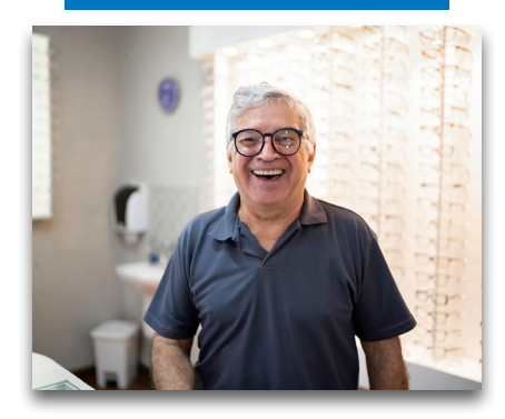
214 eve exams and 181 pairs of glasses, funded by a grant from The James Walter Pickle Charitable Foundation. were provided to needy patients.